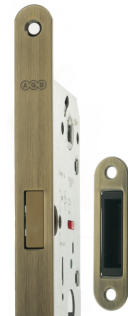
Antique Brass (AB) EASY-FIX Strike Plate Pictured